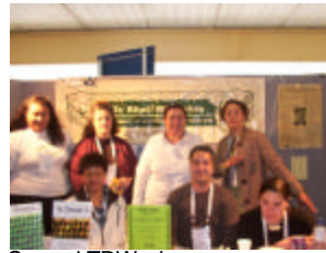
Several TRW whanau

Just a reminder folks that the 2002-2003 memberships, institutional and associate memberships have now expired. We value you as a member and with your membership and support we can continue to strive for the improved care and management of Maori staff, Maori materials and Maori clients in the industry.