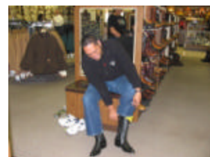
Western Warehouse, Albuquerque